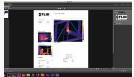
Image descriptions and text and voice comments can be added to create compelling, easy-to-interpret reports.