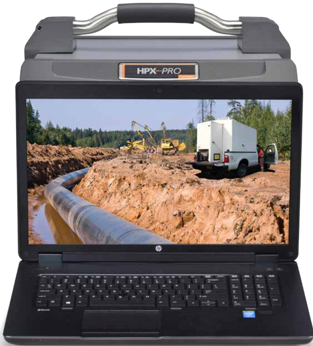
Product size to scale.

keep in pace with extreme process conditions like pipeline imaging. The new software tools also provide quick image analysis and customized reporting for generating unique customer reports in seconds. From hardware to software, to deep in the field and instant image sharing, the HPX-PRO is a complete system, designed to improve productivity.